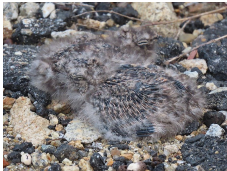
Female distraction display (far left) and two chicks at Clough Mill Road.