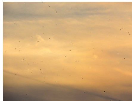
Nighthawks fill the sky (no, that's not dust on the camera lens!) on August 31, 2020.