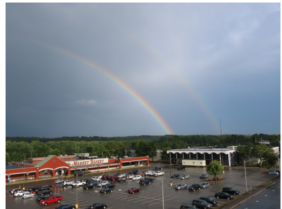
A rainbow after one of the many rain showers during the beginning of the Concord Nighthawk Migration Watch.

The winds early in the season were not conducive to high counts with many days of low numbers and rain on one of the traditional peak dates (Aug. 24). The log jam broke on August 31 with 2,202 nighthawks, the third highest daily count for this watch site. The second highest count for the 2020 migration was 381 on the late date of September 6.